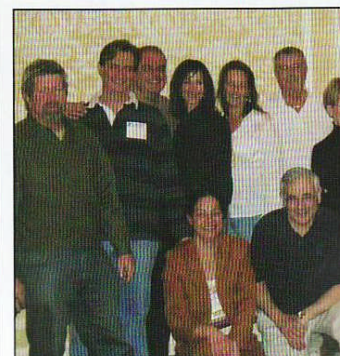
Here's the Maryland contingent celebrating at the ABL Convention.